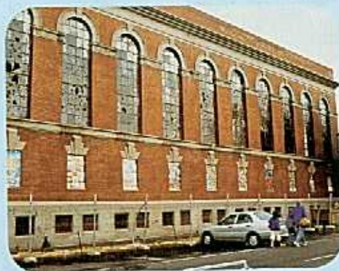
The Newport Sub Station in its current state.