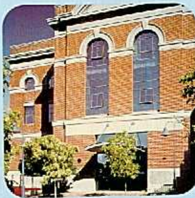
The Sub Station building in Fitzroy following a similar refurbishment project.