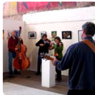
Members of the Newport Bush Orchestra Newport Bush Orchestra and the Newport Folk and Fiddle Club