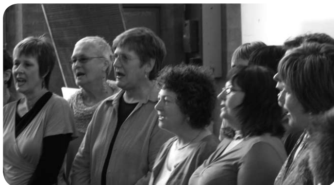
↑ members of Will'n Women performed at the Members Get Together