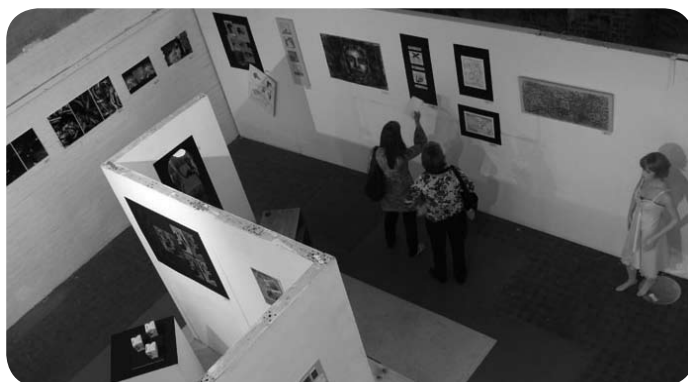
↓ some images of the VCE Exhibition