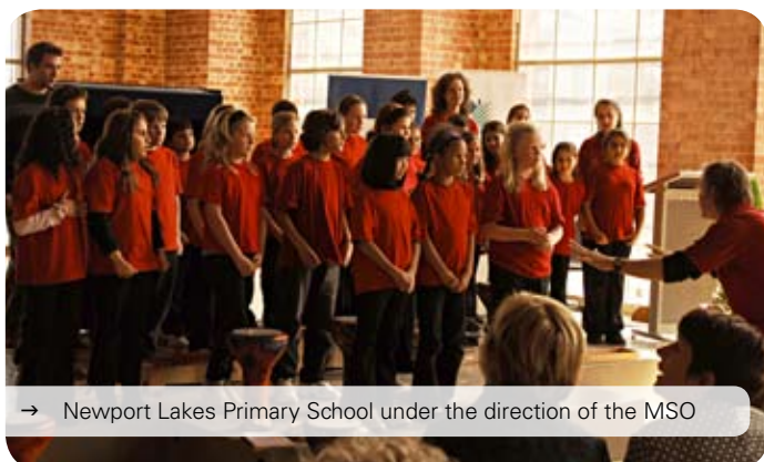
→ Newport Lakes Primary School under the direction of the MSO